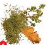
NO Green Waste