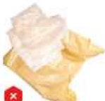
NO Loose Plastic Bags, Bagged Recyclables or Film Empty recyclables directly into your cart.