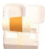
NO Foam Cups & Containers